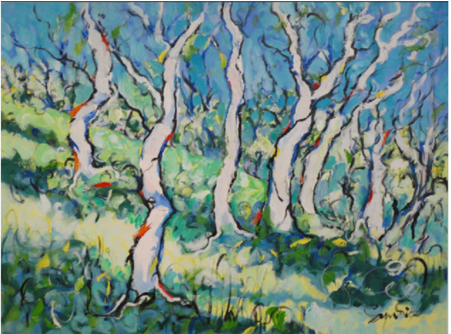
Macedon (Original canvas - 100 cm x 75 cm)

Opposite page: Greek Symbol (Original canvas 110 cm x 160 cm)