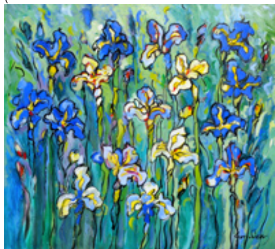
Field of Irises (114 cm x 125 cm)