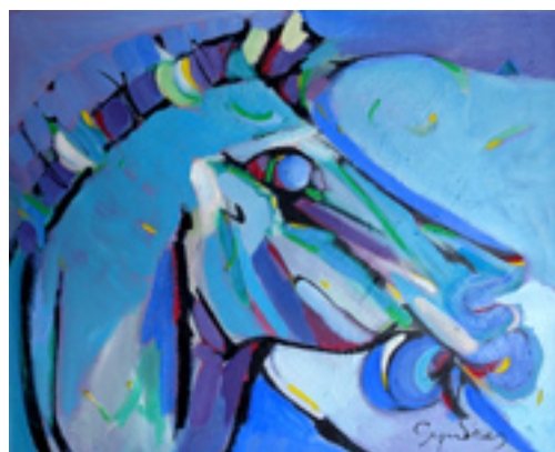
Self (79 cm x 64 cm)